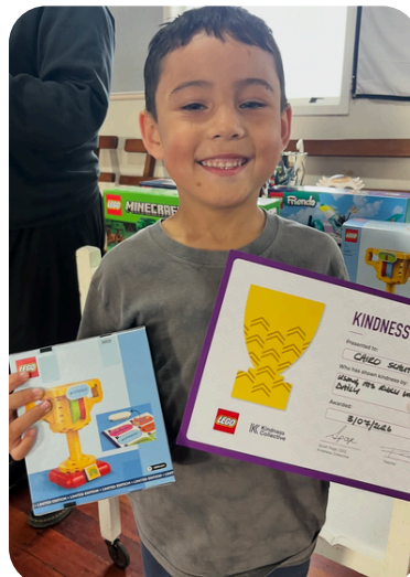
Junior Runner up: Cairo